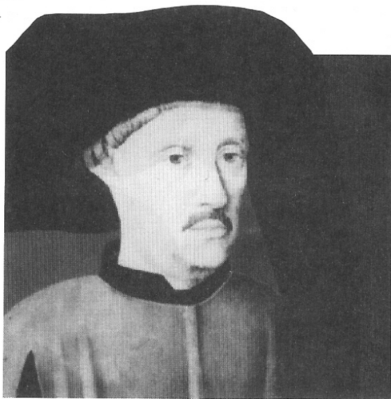
Prince Henry the Navigator was known as "he who first revealed seas and lands, which he traced on charts."

Henry also was driven by economics—a desire to establish lasting commercial links. Trade was an incentive