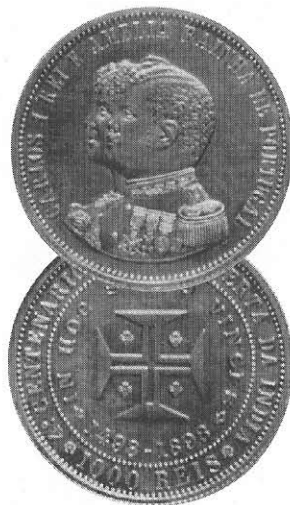
In 1898 Portugal issued a 1,000-reis coin (shown), as well as 200- and 500-reis pieces, to mark the 400th anniversary of the discovery of India by Vasco da Gama.

After the discovery of the Atlantic islands of Porto Santo and Madeira in 1419 and 1420, Henry took charge of their colonization. In 1433 his older brother, King Duarte, gave him the islands, and in 1439 by virtue of a letter from another brother, the Regent Dom Pedro, he was