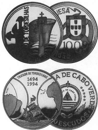
Portugal and the Cape Verde Islands have issued 1,000-escudo coins to celebrate the 500th anniversary of the Treaty of Tordesilhas.

by António M. Trigueiros and Arthur L. Friedberg, LM 4434