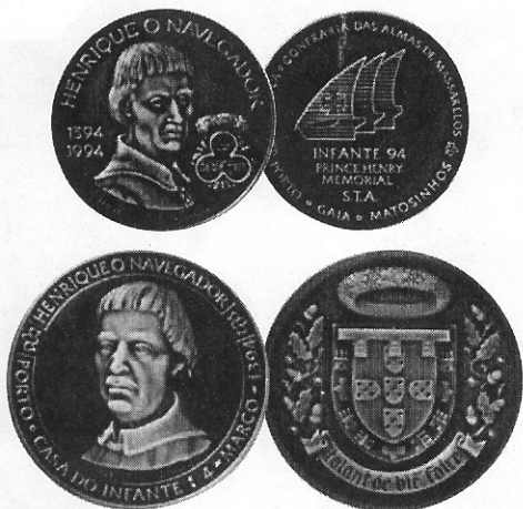
Recent Portuguese State Mint releases include 40mm silver and 80mm bronze medallions commemorating the 1994 Cutty Sark Tall Ships' Race/Prince Henry Memorial Regatta.

Collectors in North America can learn more about Portugal's "Coins of Discovery" series and other issues by writing to Portuguese State Mint, P.O. Box 1057, Clifton, NJ 07014, telephone 800/421-1866.