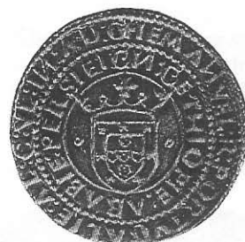
The royal titles that appear on Portuguese coins chart the progress of the country's voyages of discovery. A half escudo of King Alfonso V (top) declares him to be "Lord of Ceuta"; a silver tostao of King Manuel I (center) reads "Lord of Guinea"; and a gold portuguese of Manuel I (bottom) proclaims him "Lord of the Conquest, Navigation and Trade of Ethiopia, Arabia, Persia and India."

predecessors always had the conquest of the infidel in mind, not thinking them to be unjust titles . . . added these three: "Lord of the Conquest, Navigation and Commerce of Ethiopia, Arabia, Persia and India." He did not assume such a title lightly or by chance, but with much action, justice and prudence; with the arrival of Vasco da Gama and, particularly, of Pedro Alvares Cabral, he took possession through them of everything they had discovered and what was granted and given to him through the Sovereign Pontiffs.