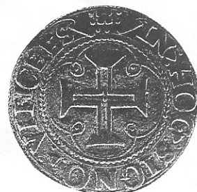
This gold português of King João III (1521-57) was issued from 1526 to 1555.