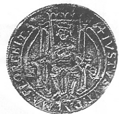
A gold justo of King João II (1481-95) depicts the king who said "No" to Columbus.