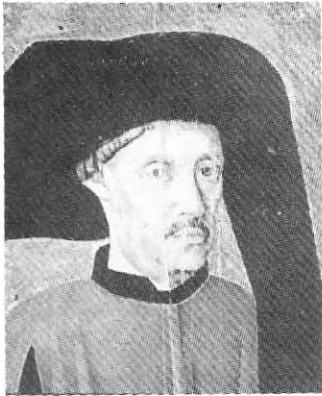
Under the guidance of Prince Henry the Navigator, the Order of Christ became the pillar of Portuguese maritime explorations.