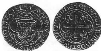
A gold cruzado of King Alfonso V (1438-81), struck by the Lisbon Mint in African gold.

Led by Prince Henry the Navigator from 1417, the Order of Christ became the pillar of Portuguese maritime exploration. In recognition of this, in 1455 King Alfonso V granted it spiritual rule "over all the lands and islands that have been and will be discovered."